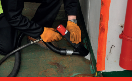
USE WITH NEEDLE SCALERS