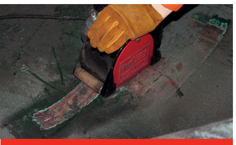
USE WITH PEENING PREPERATION TOOL