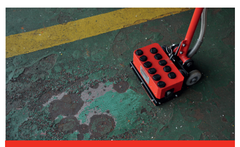
USE WITH KAV30 VACUUM