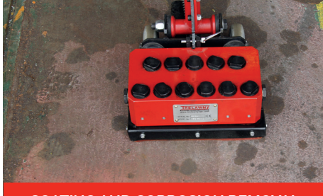
COATING AND CORROSION REMOVAL