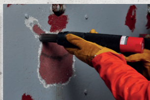
VL303 Needle Scaler