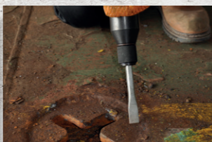
VL303 Chisel Scaler