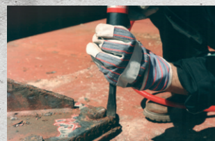
2BPG Chisel Scaler