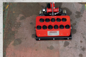
Coating and Corrosion Removal