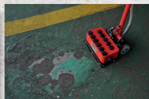
Use with KAV30 Dust Collector