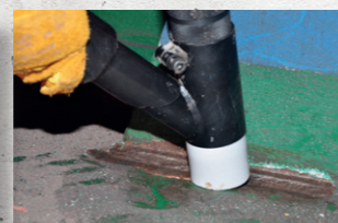
Cuffs for a Range of Applications